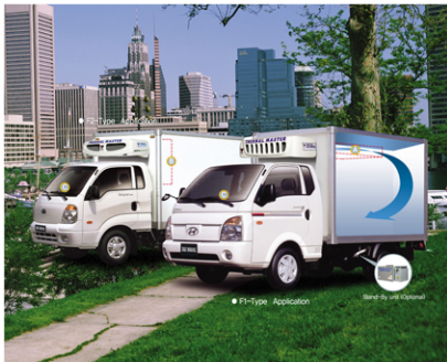
● F1-Type Application